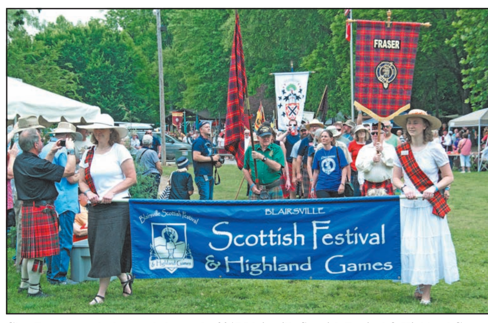
Clan Fraser was the honored clan at the 2017 Blairsville Scottish Festival & Highland Games.