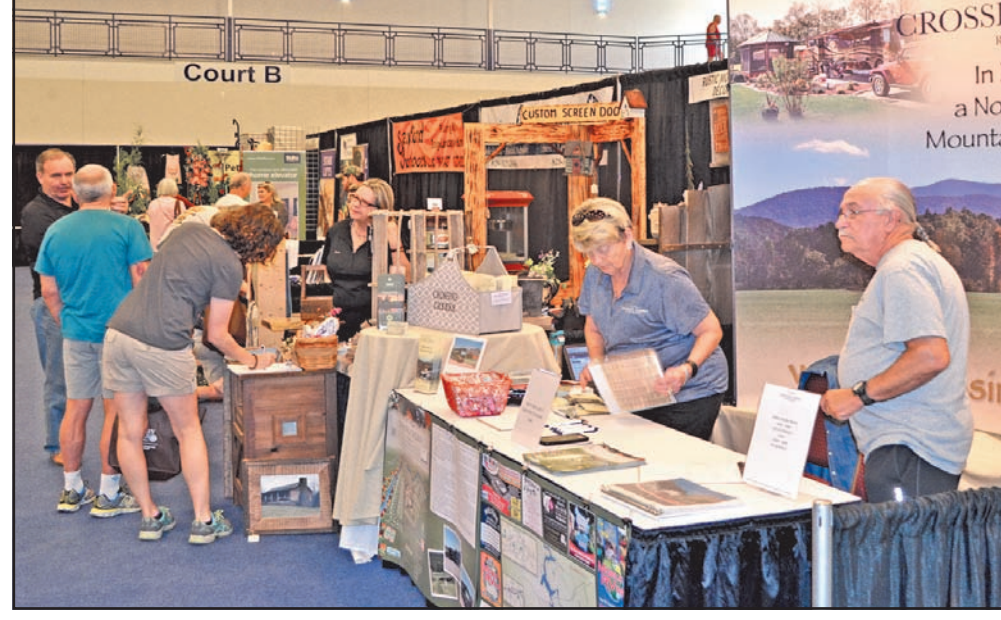
The 2017 Home & Garden Show.