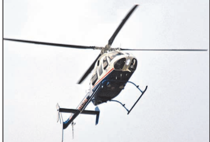
The Air Methods helicopter is based out of Union General Hospital in Blairsville.